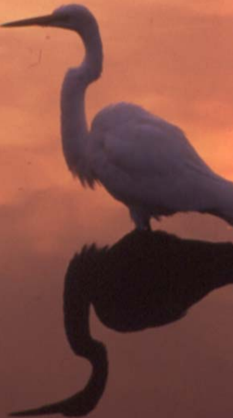
Great White Heron