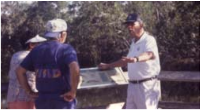
Volunteers at Blue Hole