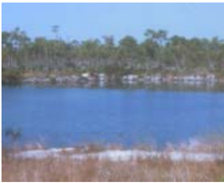
Blue Hole on Big Pine Key

on Big Pine Key at the west end of Watson Blvd.