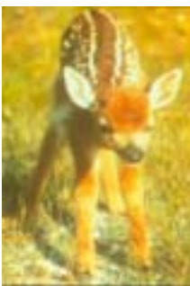
Key Deer Fawn

National Key Deer Refuge is located in the Lower Keys and consists of a patchwork of small and large tracts of pine rockland forest, dense mangrove forest flooded by salt water, hardwood hammocks and freshwater wetlands. Most of the refuge is open to the public. The refuge has three self interpreted areas - the Blue Hole, the Jack Watson Wildlife Trail and the Fred Manillo (wheelchair accessible) Wildlife Trail. Refer to the map for their location. Also, visitors are welcomed to hike refuge fire roads that are open for access. There are additional hiking trails on Cudjoe Key, Upper Sugarloaf Key, and Lower Sugar Key and the trail locations are shown on the map.