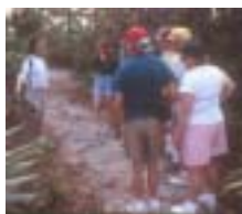
Jack Watson Nature Trail Hike