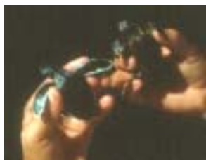
Green and Loggerhead Nestlings

These lands maintain a unique biodiversity by protecting and preserving important freshwater wetlands, mangroves, tropical hardwood forests (hammocks), and pine rockland forests. Together, these habitats provide the four basic components of a habitat - food water, shelter, and open space, necessary for the