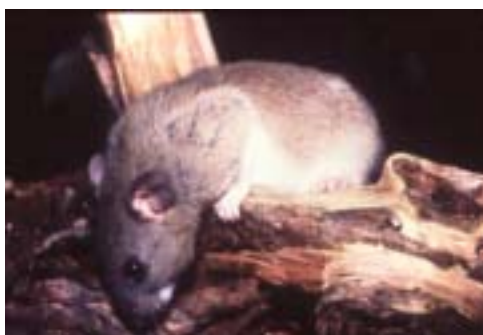
Key Largo Woodrat

supports a high diversity of plant species, 80% of which are of West Indian origin. The refuge and the adjacent Key Largo Hammock State Botanical Site contain the