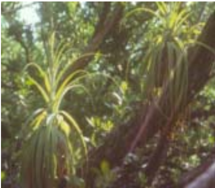
Bromeliads in Buttonwood Tree

ridley turtles, the occasional manatee, and are vital nursery grounds for hundreds of species of fish and shellfish. The refuge also preserves the scenic, wild character of the Florida Keys Backcountry. For more information about boating in these two refuges, please obtain a copy of the Key West and Great White Heron National Wild Refuges Backcountry regulations brochure.