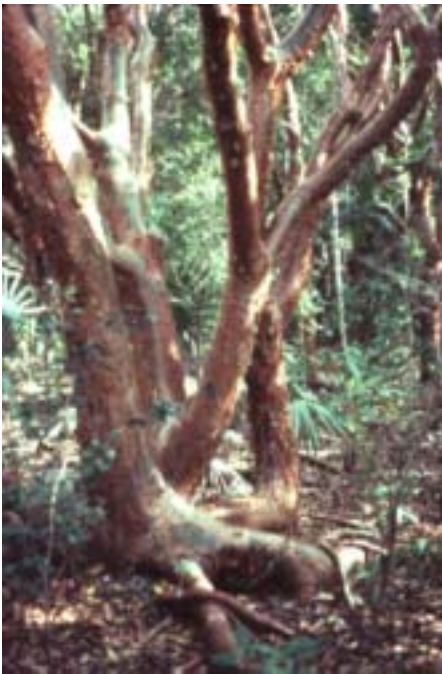
Gumbo Limbo Tree

ridley turtles, the occasional manatee, and are vital nursery grounds for hundreds of species of fish and shellfish. The refuge also preserves the scenic, wild character of the Florida Keys Backcountry. For more information about boating in these two refuges, please obtain a copy of the Key West and Great White Heron National Wild Refuges Backcountry regulations brochure.