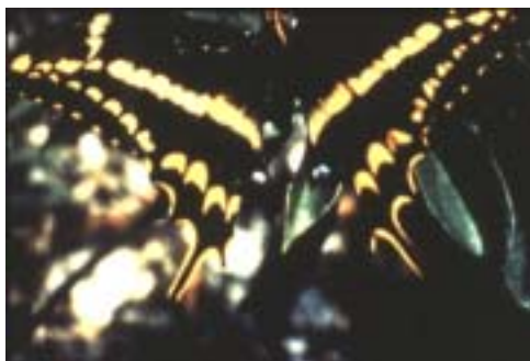
Schaus Swallowtail Butterfly

Welcome to the Florida Keys! There are four National Wildlife Refuges located in this extraordinary and seemingly endless expanse of sea, islands and sky - the National Key Deer Refuge, and Great White Heron, Key West, and Crocodile Lake National Wildlife Refuges. These refuges are part of a vast subtropical ecosystem. This distinctive chain of islands stretches almost 150 miles from the southeastern tip of Florida, curving gently westward dividing the aqua-green waters of the Gulf of Mexico from the distant deep blue Atlantic Ocean. These refuges support several habitats that sustain a wide variety of plants and animals, some of which do not exist anywhere else on earth.